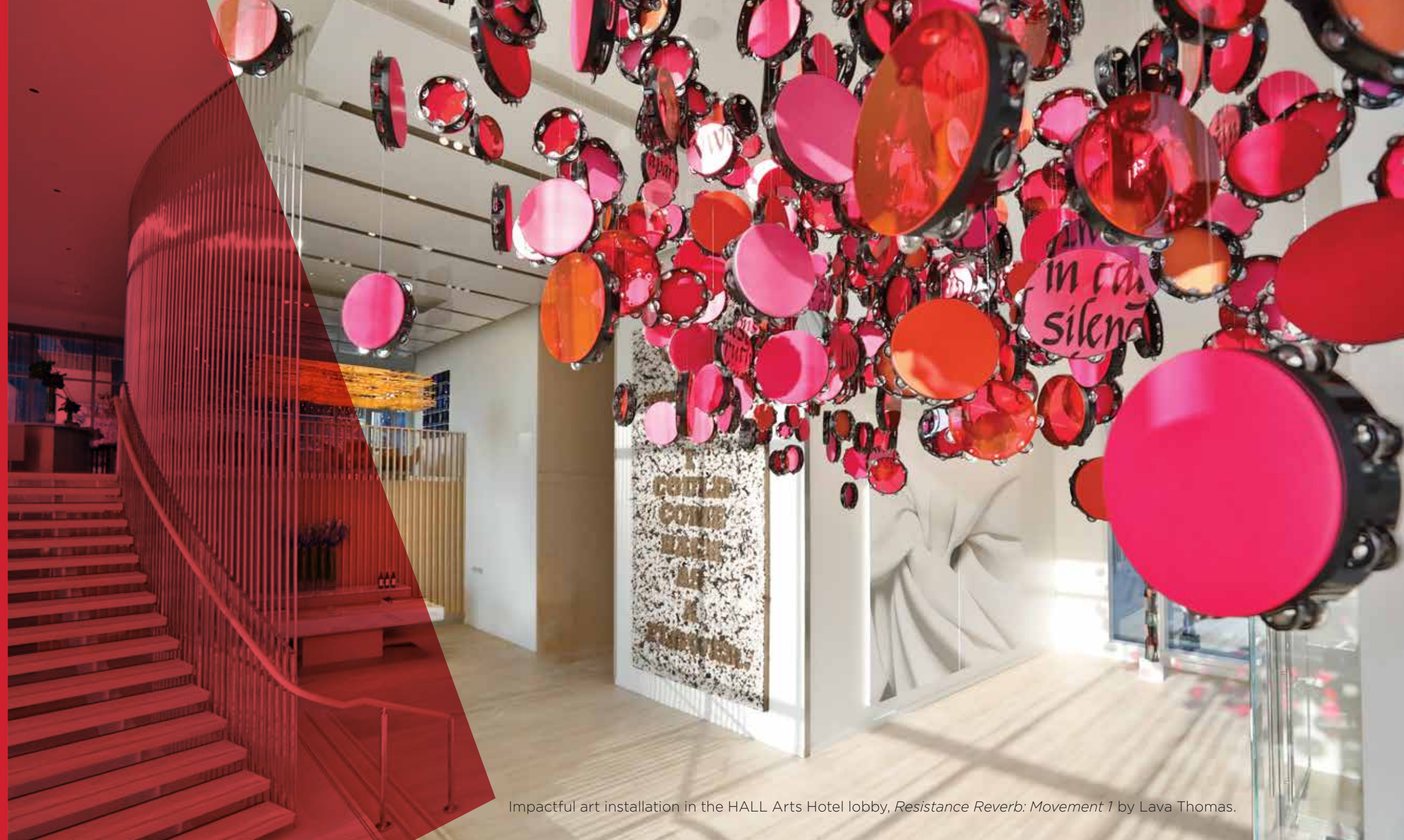
Impactful art installation in the HALL Arts Hotel lobby, Resistance Reverb: Movement 1 by Lava Thomas.